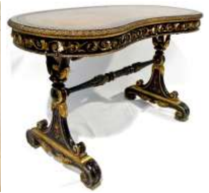
Regency Library Table