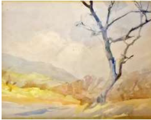
Archibald Knox x2